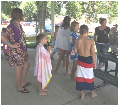
Members anxiously await their turn to spin the prize wheel!

We had a beautiful day for our Back-2-School Social on August 7. Root beer floats were served at the Voorhees picnic shelter outside of Splash Central. Of course we had prizes to give away as well! We enjoy getting a chance to visit with our members outside of the office. Thank you to all who attended!